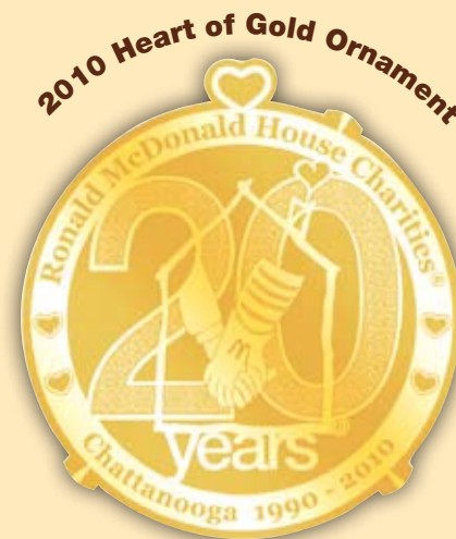
This 2010 Heart of Gold ornament celebrates the 20 th Anniversary of Ronald McDonald House Charities® of Greater Chattanooga.

Our 2010 Hearts of Gold go on sale this November. For more information, visit www.rmhchattanooga.com .