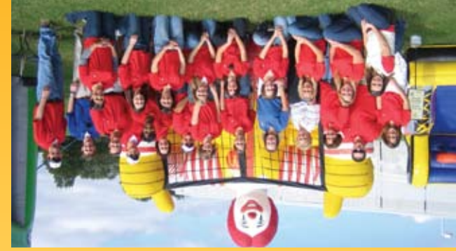
Pictured are 2009 Committee members which includes TSCPA and RMHC staff.

For more information, call (423) 778-4300 or visit www.rmhcattanooga.com