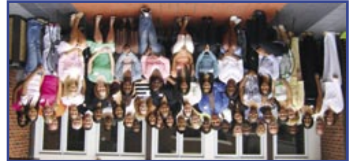
Pictured are the 2005 RMHC Scholarship recipients and members of the McDonald's Chattanooga Co-op.

FROM THE EXECUTIVE DIRECTOR AND PRESIDENT OF THE BOARD