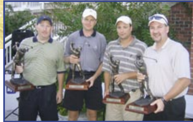
The Ameriprise Financial team were the winners of the 2005 RMHC Golf Classic.

598 children received dental treatment in 1,867 visits at 20 sites 498 treatment plans completed; many requiring multiple visits 135 children referred out for more specialized care 2,160 preventive procedures performed (sealants) 365 restorative procedures performed $174,204.00 in free care given to children in need