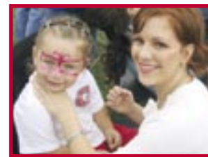
Face painting is always a popular event at the Autumn Children's Festival.